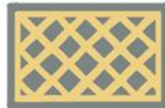
Do not stop the car in this area