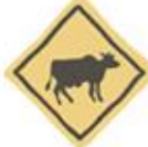
Beware of Animals