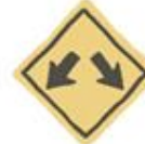
Beware of the way