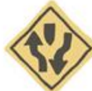
Beginning of center divider side