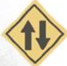
Two Way Traffic