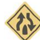
End of center divider side